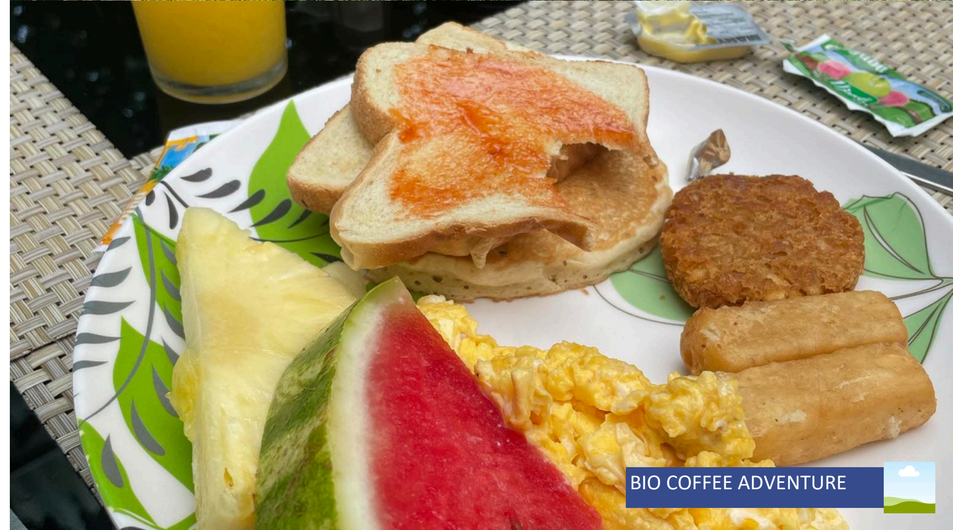
BIO COFFEE ADVENTURE