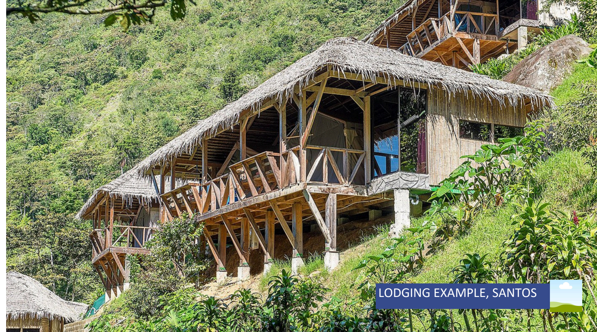
LODGING EXAMPLE, SANTOS