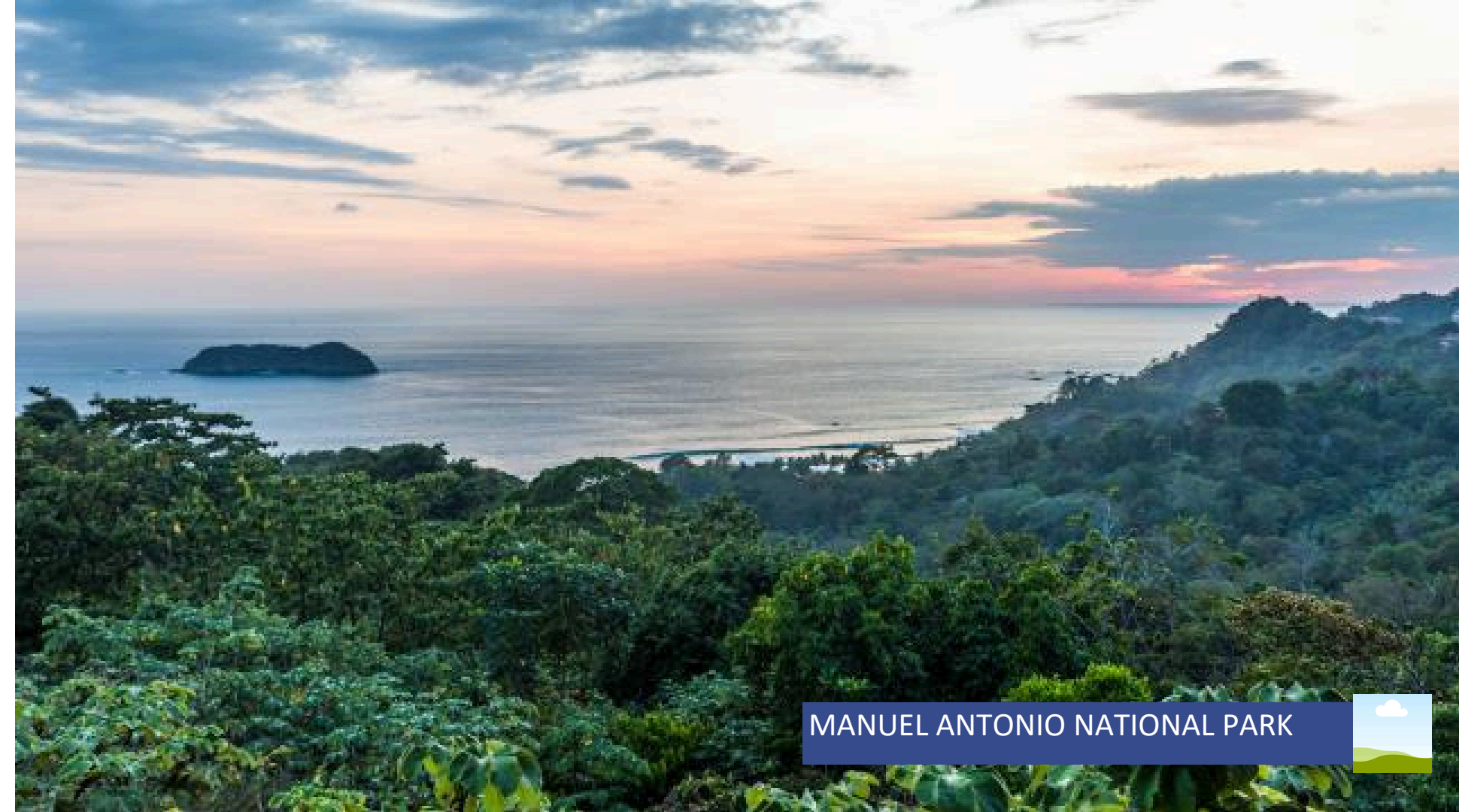
MANUEL ANTONIO NATIONAL PARK